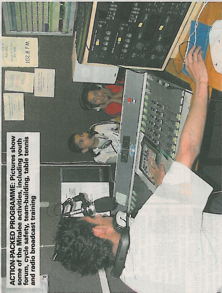
ACTION-PACKED PROGRAMME: Pictures show some of the Mitalee activities, including youth forum, cycle safety, team-building, table tennis and radio broadcast training